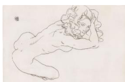
Lot 037 Egon SCHIELE Female Nude 1917 Estimate: 30,000,000 - 50,000,000 JPY