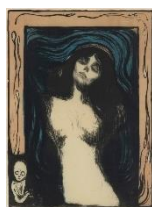
Lot 044 Edvard MUNCH Madonna (Schiefler 33; Woll 39) 1902 Estimate: 40,000,000 - 70,000,000 JPY