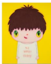
Lot 120 Javier CALLEJA No Words Today 2019 Estimate: 20,000,000 - 30,000,000 JPY

For press inquiries OKAMURA (Ms.), SUZUKI (Ms.)