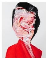
Lot 152 TAKEDA Teppei Painting of Painting 040 2021 Estimate: 5,000,000 - 8,000,000 JPY

Access to the online catalogue (to be released on Friday, February 13, 2026)