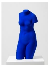
Lot 023 Yves KLEIN La Vénus d'Alexandrie (Wember S41; Ledeur S41) 1962 cast in 1982 Estimate: 10,000,000 – 15,000,000 JPY