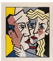
Lot 104 Roy LICHTENSTEIN The Couple (Corlett 175) 1980 Estimate: 2,000,000 - 3,000,000 JPY