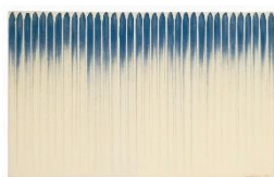
Lot 128 LEE U-fan From Line 1978 Estimate: 50,000,000 - 80,000,000 JPY