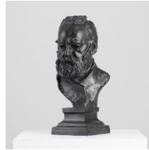
Lot 047 Auguste RODIN Buste de Victor Hugo dit a l'illustre maître (réduction avec piédouche intégré) 1883 cast in 1980 Estimate: 3,000,000 - 5,000,000 JPY