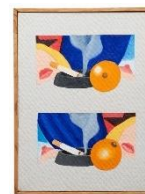
Lot 108 Tom WESSELMANN Double Study for Bedroom Painting #2 1968 Estimate: 20,000,000 – 30,000,000 JPY