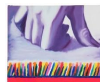
Lot 031 James ROSENQUIST Untitled 1969 Estimate: 30,000,000 - 50,000,000 JPY

For press inquiries OKAMURA (Ms.), SUZUKI (Ms.)