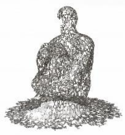
Lot 025 Jaume PLENSA Tokyo's soul 2007 Estimate: 15,000,000 - 30,000,000 JPY