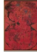
Lot 072 SAITO Yoshishige Work 1 1960 Estimate: 20,000,000 - 30,000,000 JPY