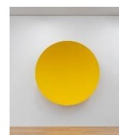
Lot 024 Anish KAPOOR Untitled 1999 Estimate: 50,000,000 - 100,000,000 JPY